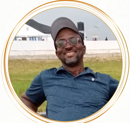
Hon. Justice Cletus O. Emifoniye