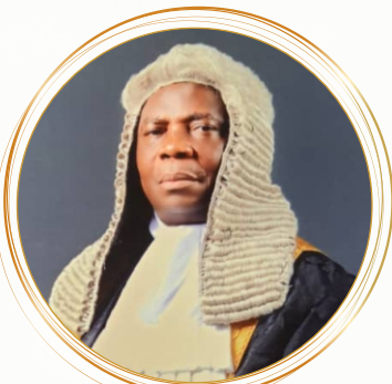
Bertram Metong, SAN