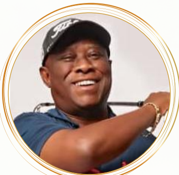
Oluwole Iyamu, SAN