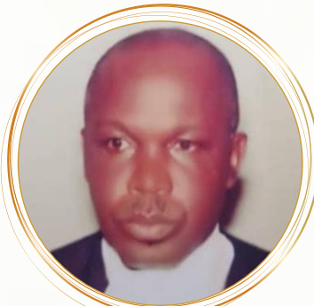
Donald De-Nwigwe, SAN