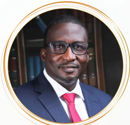
Ayodele Akintunde, SAN