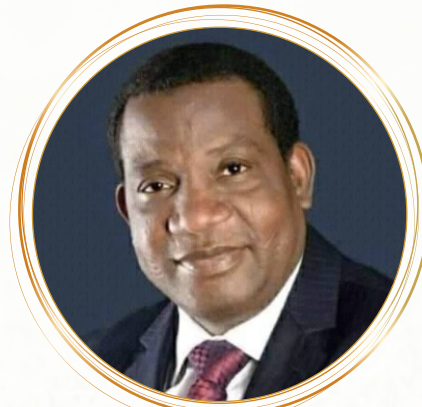
HE Simon Bako Lalong